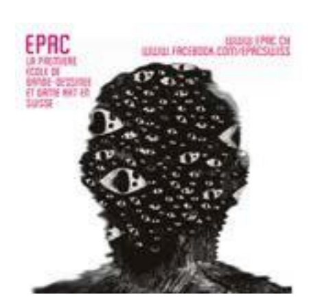
Stickers for the magazine Strapazin, Zurich