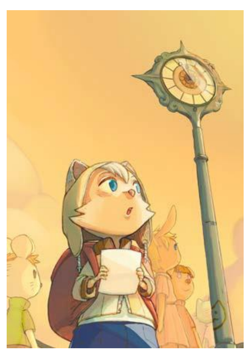
Alumni: Aline Schroeter, diploma work