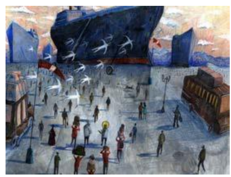
Alumni Dexter Maurer