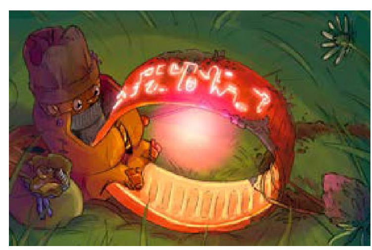
EPAC, Hélène Dupré

Warning: in the text of this brochure, the masculine gender is used as the neuter gender.