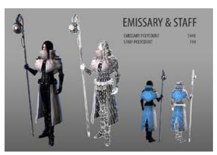
Kevin Péclet, character design of the game Emissary.